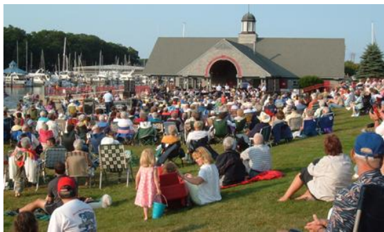
City of SH "Riverfront Concert Series" 2016 Grant Recipient

During the 2015 Fall and 2016 Spring grant sessions, the SHCF's Grant Committee considered a record number of applications. Nearly $30,000 was awarded to area non-profits, with a focus on the areas of education, visual arts, performing arts, recreation, information and community health. The Committee conducted personal interviews with several applicants to gain increased understanding of their objectives and processes, a practice that will be expanded in the future. The next grant session is Spring 2017. Grant applications should be submitted by April 15th.