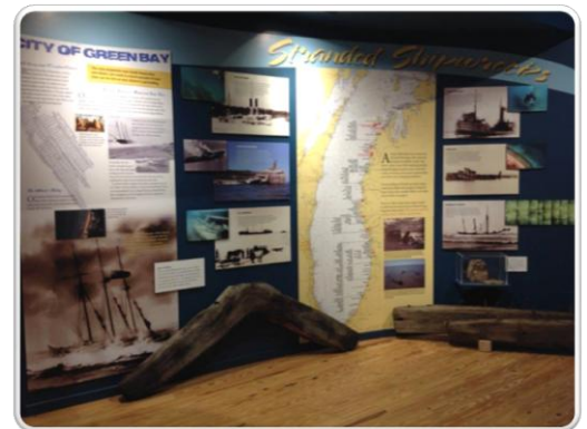
Michigan Maritime Museum "Children's Interactive Coast Guard Exhibit" 2016 Grant Recipient